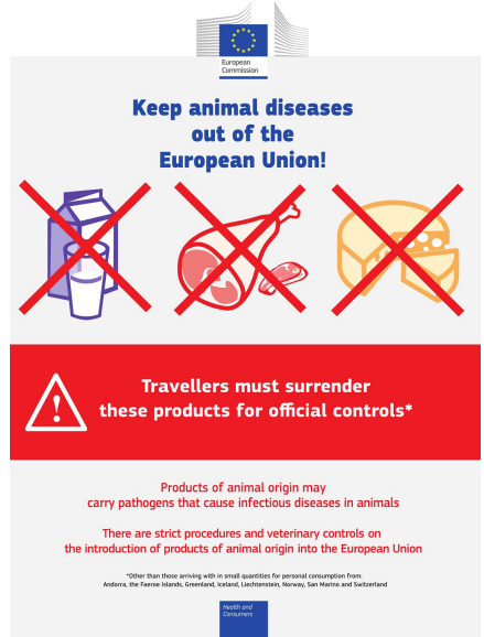
Importing food for personal use

Due to the risk of introducing diseases into the European Union, there are strict procedures for the introduction of certain animal products into the EU (*) (in line with <u>Commission Delegated Regulation</u> (EU) 2019/2122). These procedures do not apply to the transport of products of animal origin between EU Member States or to products originating in Andorra, Liechtenstein, Norway, San Marino and Switzerland.